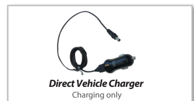
Direct Vehicle Charger Charging only